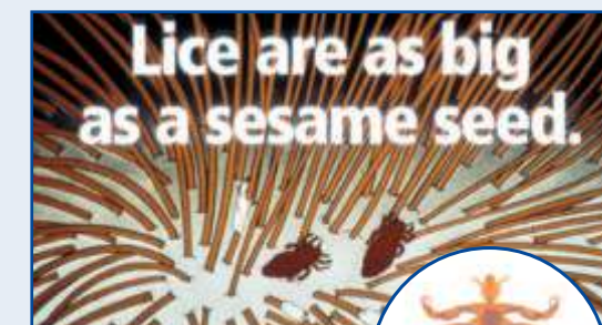
Illustration courtesy of Bayer Corporation