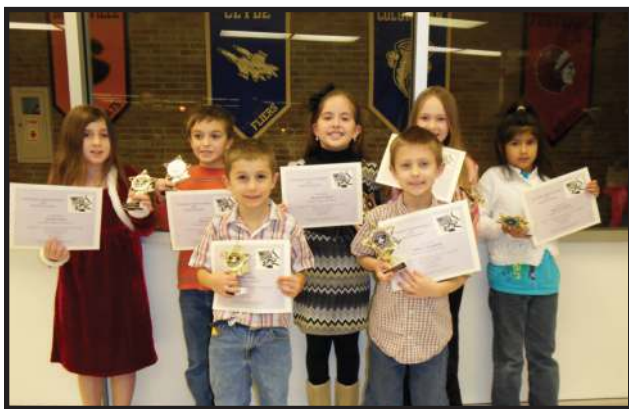
Second Grade Students-of-the-Month pictured left to right: