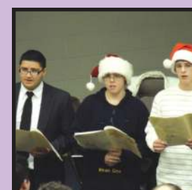
Some members of The Ross Choir singing for the Board.