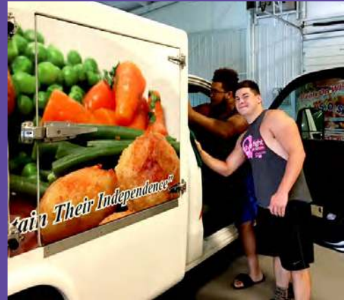
Ross High School tennis and football players volunteered to wash the W. S. O. S. Meals on Wheels vans