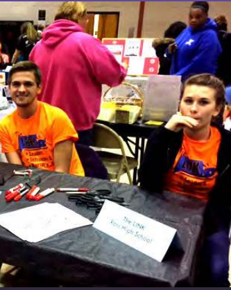
spread the DRUG Carbon Spooktacular at college.