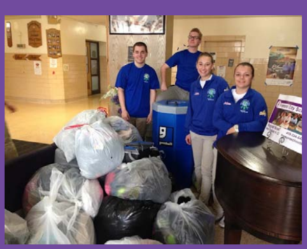
Teen Leadership Class collects clothes for Goodwill.