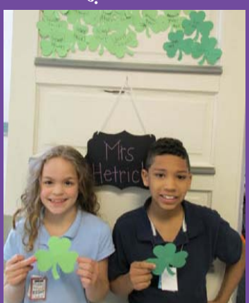
The Shamrock Sale at Stamm was a success.