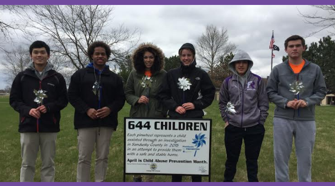
LINK students partnered with Department of Job & Family Services Children's Services Division by helping put up pinwheels after school.