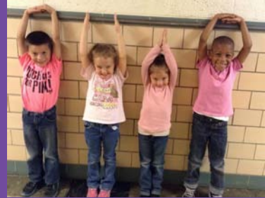
Stamm Elementary students participate in Think Pink O-H-I-O.