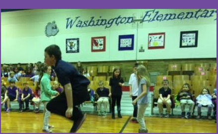
Jump Rope for Heart at Washington Elementary. Students raised $2,651.00.