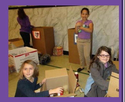
Stamm Make a Difference Club collected food in the 2nd annual Stamm vs. Lutz Food Drive. Stamm