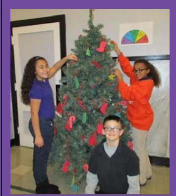
Stamm Make a Difference Club sold paper ornaments to raise money to donate to our Community Christmas family.