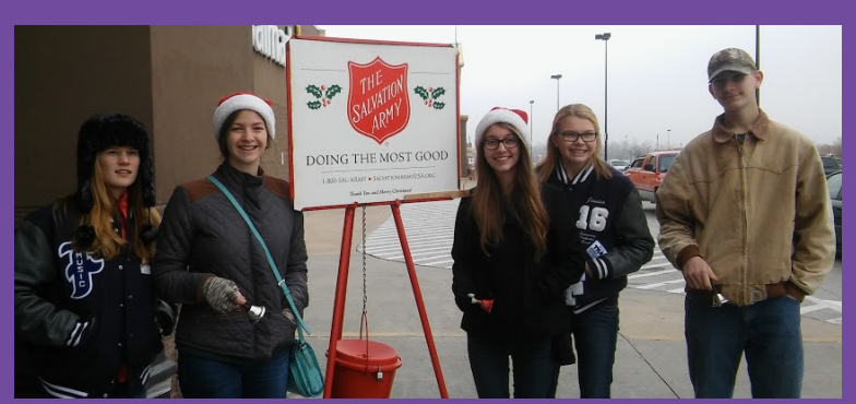
Ross High Key Club members rang the Salvation Army bell to assist in collecting money during the holiday season.