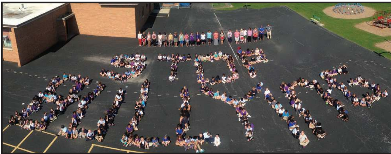
Atkinson Elementary School Students Say, "Stop Bullying!"

Fremont City Schools provides several training opportunities for our students in the area of Bullying Prevention. There are multiple programs that work together to help our students and staff recognize the signs of bullying and identify ways to help each other and be kind to one another.