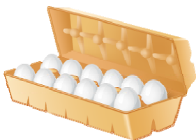
Checking out the condition of Eddie.