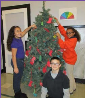
Stamm Make a Difference Club sold paper ornaments to raise money to donate to our Community Christmas family.