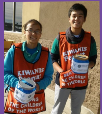
Ross High Key Club participated in Kiwanis Club's Peanut Day.