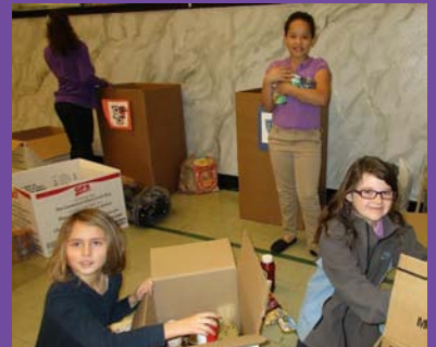
Stamm Make a Difference Club collected food in the 2nd annual Stamm vs. Lutz Food Drive. Stamm won.