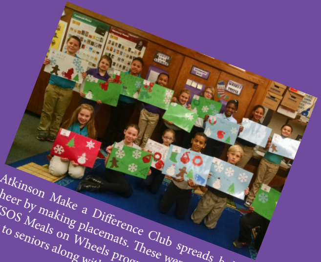
Atkinson Make a Difference Club spreads holiday cheer by making placemats. These were taken to the WSOS Meals on Wheels program and were handed out to seniors along with their meals.