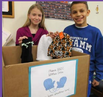
Stamm Make a Difference Club held a Mitten Drive in the month of January to collect mittens, gloves, hats, and scarves for those less fortunate. All items were donated to Pontifex and Sandusky Share and Care.