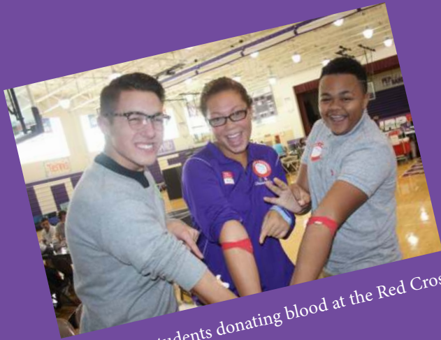
Ross High students donating blood at the Red Cross Bloodmobile.