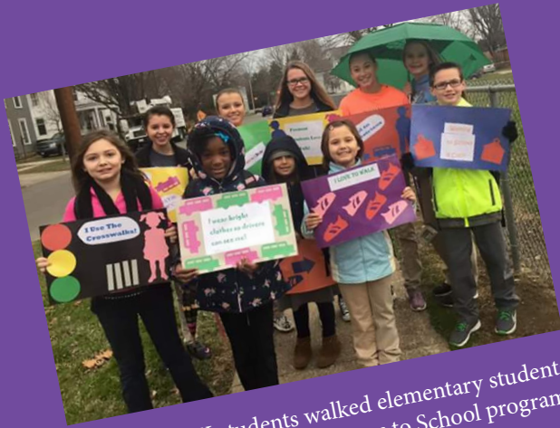
Ross High LINK students walked elementary students to school as part of the Safe Routes to School program.