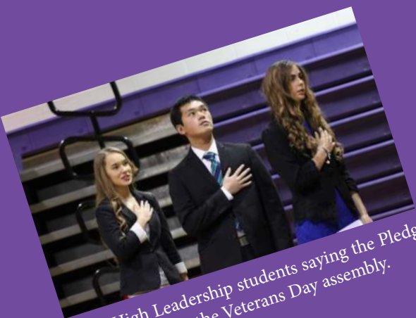
Ross High Leadership students saying the Pledge of Allegiance at the Veterans Day assembly.