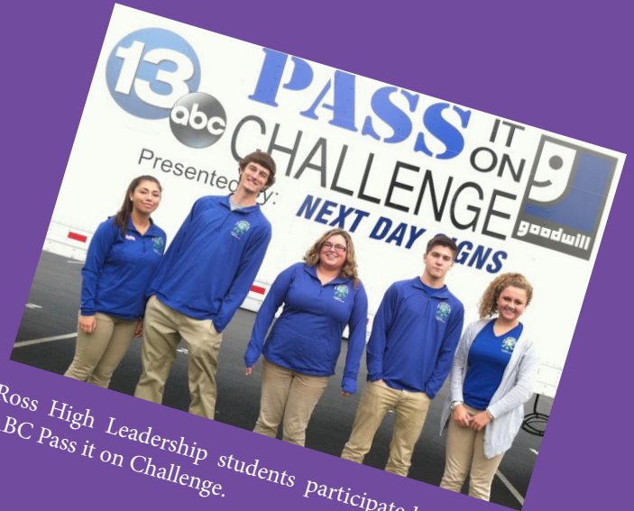
Ross High Leadership students participated in the 13 ABC Pass it on Challenge.