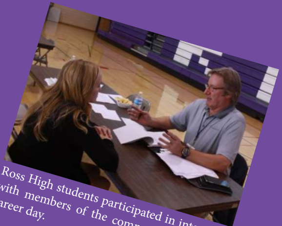
Ross High students participated in interviews with members of the community as part of career day.