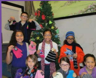
Stamm Make a Difference Club had their annual collection of hats, gloves, and scarves for students who are in need.