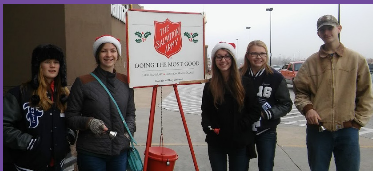
Ross High Key Club members rang the Salvation Army bell to assist in collecting money during the holiday season.