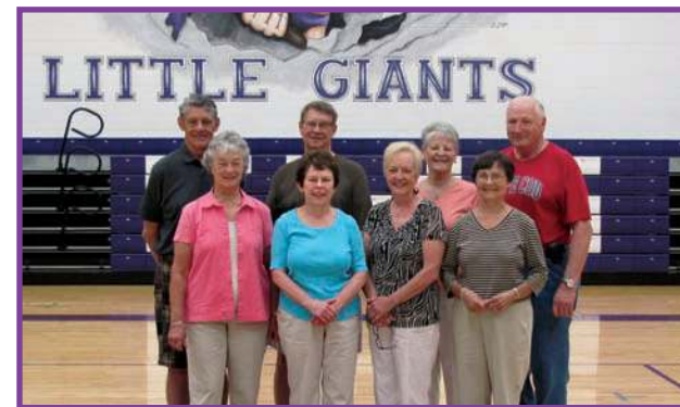
The Class of 1958 enjoyed their tour of Fremont Middle School on July 13th.

Pictured above are the 2013 Senior Gold Medal Winners.