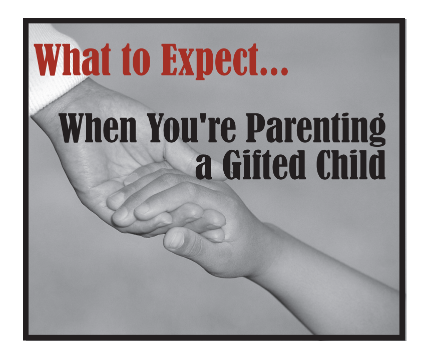
A Handbook for Parents and Guardians of Gifted Children

For More Information, contact The Parent Division Chair: <u>parent1@oagc.com</u>, Voicemail: 614-337-0386 www.oagc.com